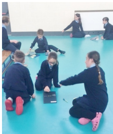
4 th & 5 th testing out how friction works