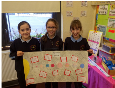
Emily, Sadie & Emily's project on The Solar System

You can view more photos of the day on our website www.boardsmillns.ie