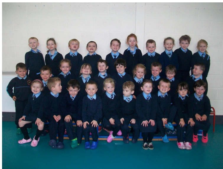
Welcome to our new Junior Infants who are all settling in so well to big school!