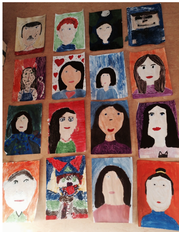
Van Gogh inspired Self Portraits in 4 th and 5 th class