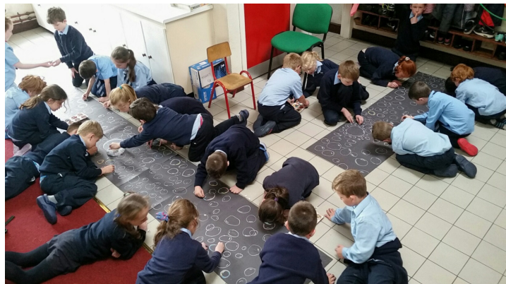
Bubble Art in 2 nd Class