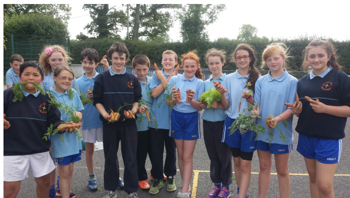
Carrot Harvest - our school garden continued to flourish during the summer holidays!